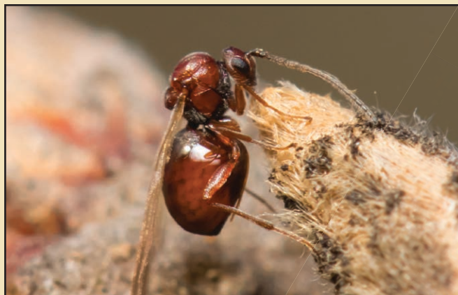
Adult female of Andricus quercuscalifornicus with eggs visible through abdomen.

Gall wasps in the family Cynipidae are tiny insects that induce galls on plants. These galls are abnormal growths that enclose the eggs of the wasp, providing food and shelter for the developing larva. How the wasps force the creation of the galls is not well understood. The shape of the gall is unique to each wasp species. Most species have alternating generations of both males and females, and females only. The most noticeable galls (and the ones covered in this guide) are usually in the female-only, or agamic, generation.