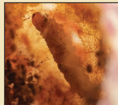
Inquiline moth larva