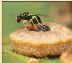
Chalcidoid wasp ( Aprostocetus sp.)

Oak galls are subject to invasion or predation from a number of different sources. Many are parasitized by Chalcidoid wasps which inject their eggs into host galls. Cynips mirabilis galls are frequently parasitized by an inquiline moth that feeds on the interior of the gall.